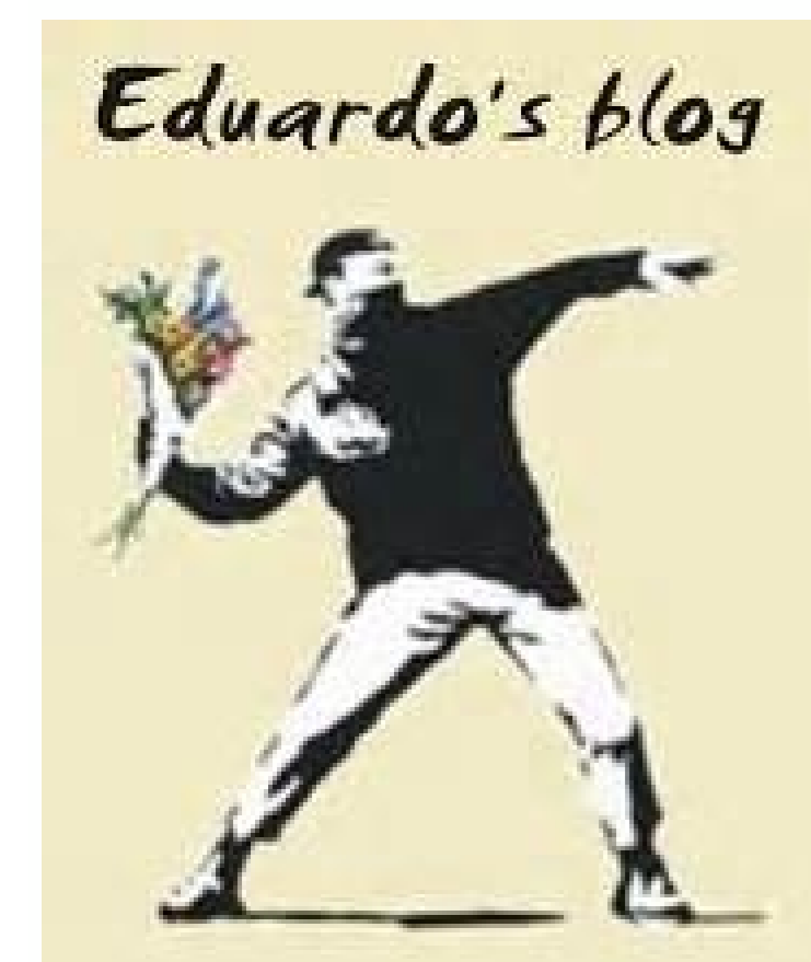
Anarchist from colony sub indo.